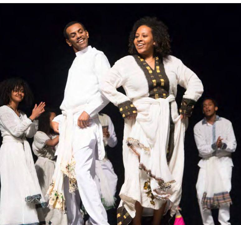
Dance performance at the 2015 MSU African Student Union Gala.

This resistance to foreign domination and the zeal to produce Africa's own art and literature however, put "partnership" in the cultural sector between African and foreign universities on a slippery pedestal. The two were on a collision path and the concept of partnership was difficult to apply because the relationship was still that of a former colonial master who still wanted to dominate and the former subject who was rejecting such domination. Indeed, even the term "partnership," an invention of the late 1990s development aid debate, did not exist at the time. Yet through the art and literature of self-determination, people's lives were transformed to value African aesthetics and identity.