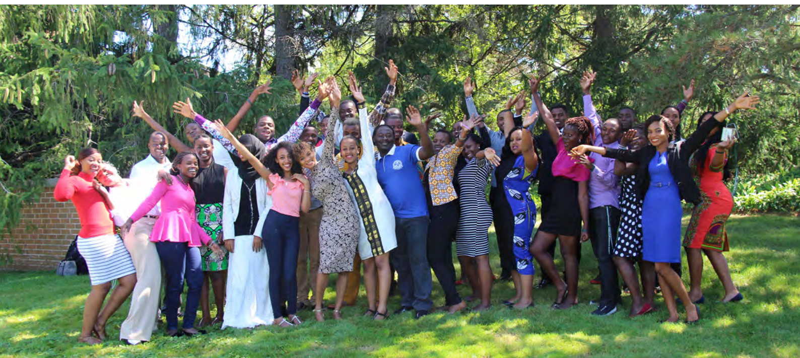
The 2015 cohort of The MasterCard Foundation Scholars at MSU.

entrepreneurship? It will require all of these and much more! The effective development of young people in Africa, irrespective of their sub-region, religion, and socioeconomic realities involves more than just formal education or even skills development. It requires a concerted and deliberate effort by individuals and institutions who are committed to the success of these young people and who are willing to devote time, resources, and energy to ensure that they are well equipped for the future. It requires a recognition that African youth are not a homogeneous group. Even within a single geographic location, you will find young people along a wide-ranging continuum of age, experience, education, interests, capabilities and aspirations. There is therefore no single panacea for all things African or all things youth, and no alternative to long-term commitment and engagement to address the entire spectrum of their developmental needs. There are, however, two things that I believe need to be in place before any serious conversation about youth development in Africa or anywhere else can take place, and those are core values and committed stakeholders.