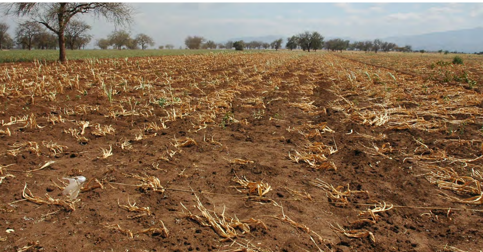
A field of dried crops due to drought in Monduli District, Tanzania.

The first case study is about the Southern Voices on Adaptation (SVA), a global-level partnership on adaptation established to help fill in the gap created by limited attention to adaptation at the global level. The SVA has brought civil society networks from Africa, Latin America and Asia under one platform to develop 10 Joint Principles on Adaptation (Southern Voices on Adaptation, 2014). The objectives of SVA are to influence policy, strengthen capacity (of government and civil society) and promote dialogue