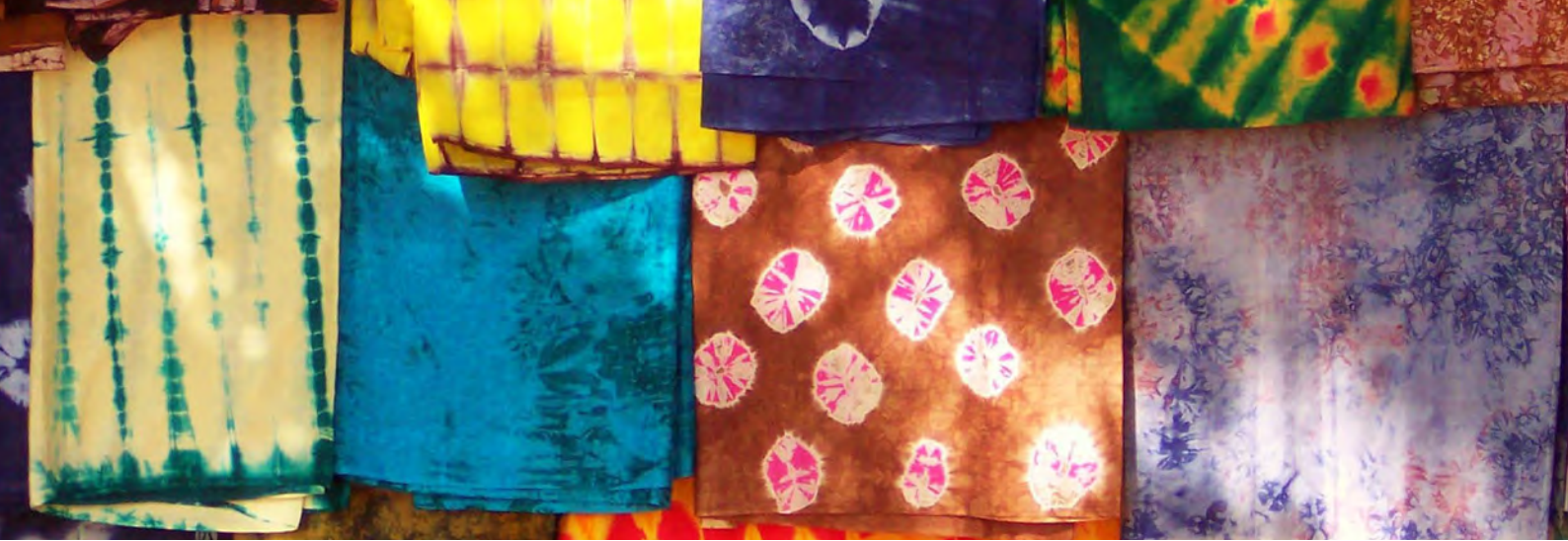
Sunlight on Ghanaian Fabric.