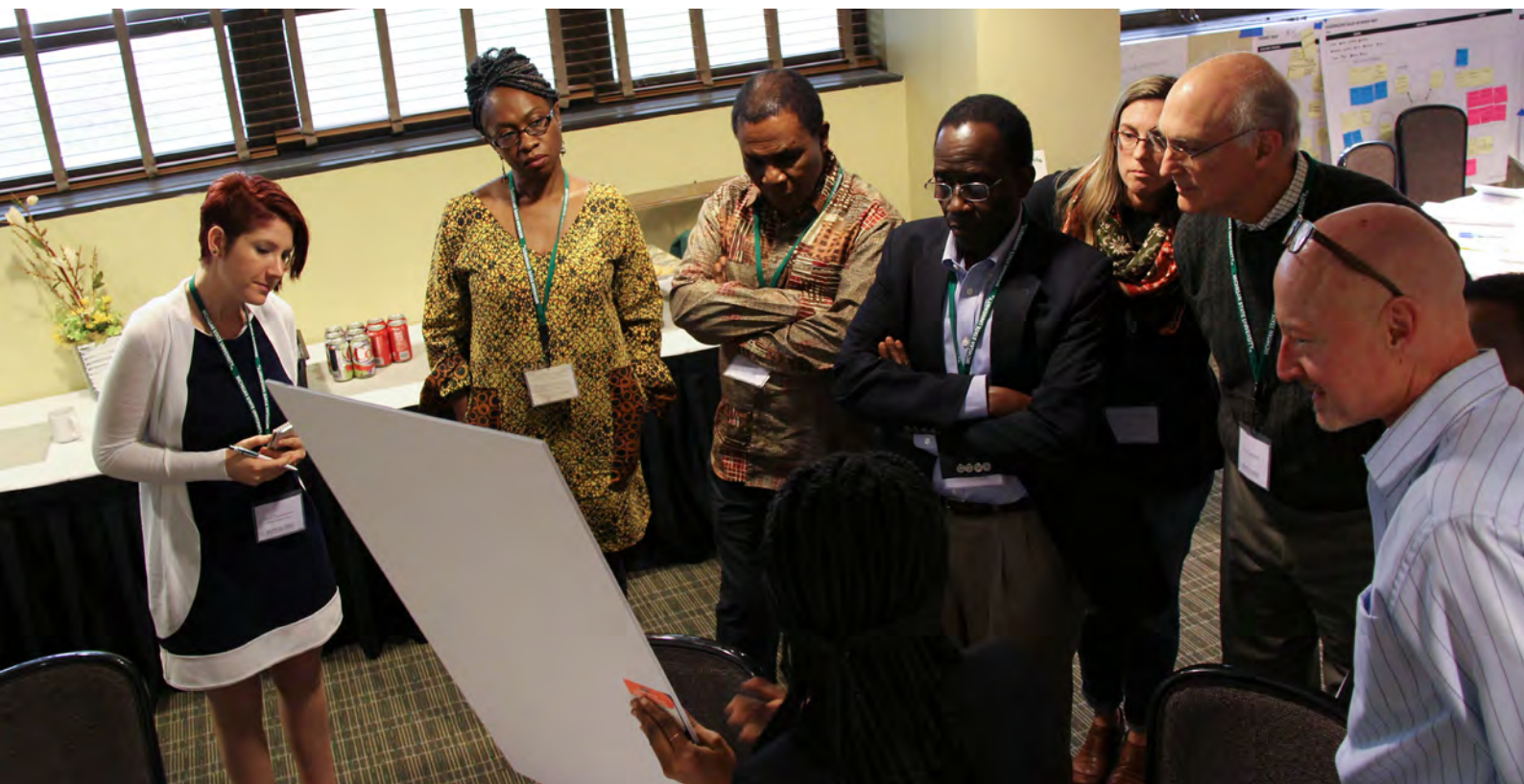
Convening participants listen to a presentation on potential activities for the Alliance for African Partnership.

The workshop opened with a simple question: "What makes a good partnership?" The answer to that, as the participants discovered, is not so simple. This question was the starting point for a dynamic innovation process, utilizing design thinking techniques, that took participants through a series of structured exercises in pairs and in small teams. The two-and-a-half-day workshop had three stages: 1) identifying the principles of good and effective partnerships, 2) designing partnership activities that the AAP could enact, and 3) modeling the AAP structure and designing the next steps for the