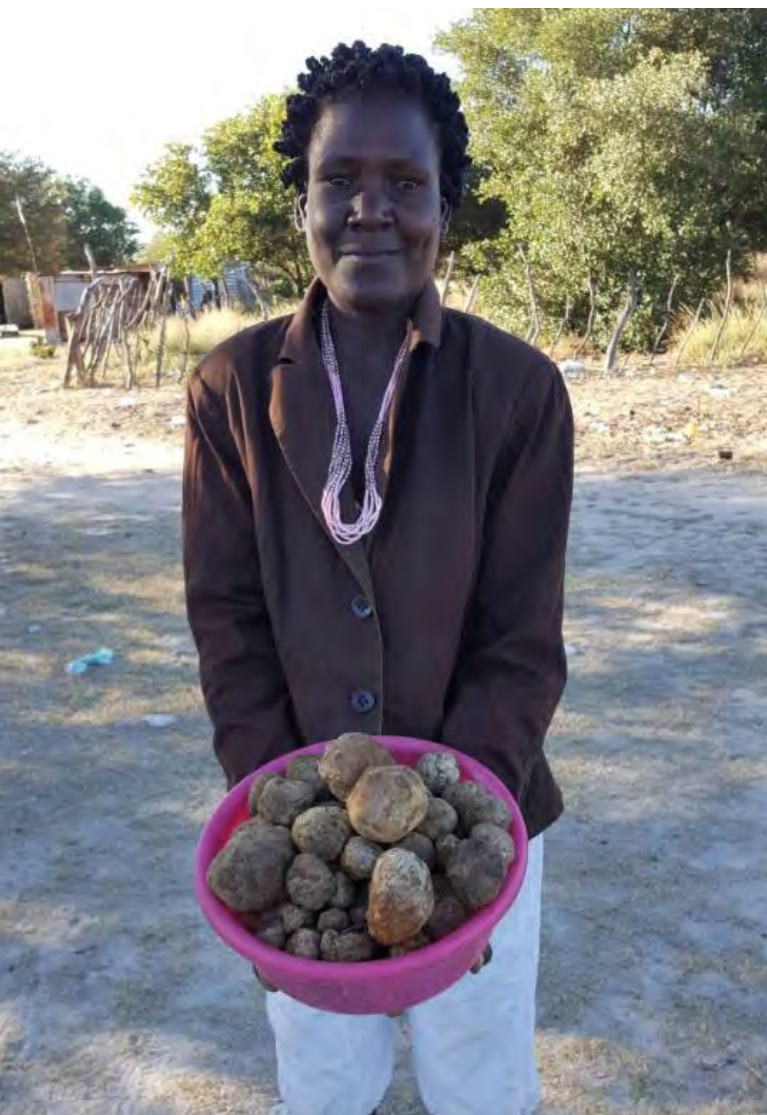
A woman displays truffles worth approximately N$100 for the Mushroom Node at the University of Namibia.