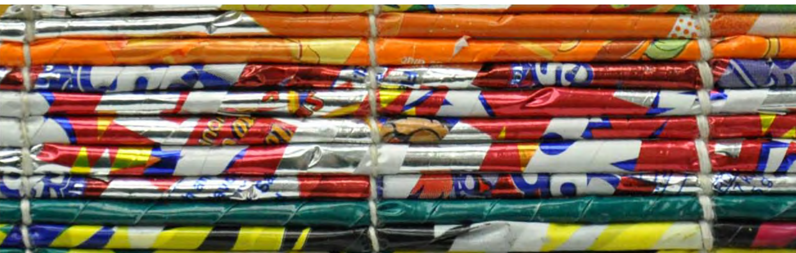
Recycled packaging table mat, Zulu, South Africa. MSU Museum Collections.

Our new Alliance for African Partnership seeks to build the relationships and networks that will take us into the remainder of the 21st century. These will not only be North-South ventures but will also promote mobility across African institutions into South-South circuits of innovation, personnel, students, and resources (Osiru). This will enable the formation of new ecosystems for development: they must be flexible, changing with different contexts and scales, adapting to new historical moments. At the same time, partnerships must be cultivated and nurtured with intention, through a process of self-reflection that can lead to positive correction and improvement (Minde). And real solutions—whether in climate change, agri-food policy, artistic exchanges or mushrooms—can inspire us collectively and move us to continue to work together for the next generations.