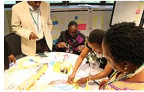
Convening participants work on their partnership models.

Between May 10-12, MSU International Studies and Programs and African Studies Center hosted a co-creation workshop to engage invited African guests and MSU faculty in open discussion and collaboration on the changing landscape in Africa and the future of institutional partnerships. This workshop provided an opportunity for the MSU community and African leaders to come together to share and build upon ideas about partnership, provide meaningful feedback, and identify the best approaches for building the AAP.