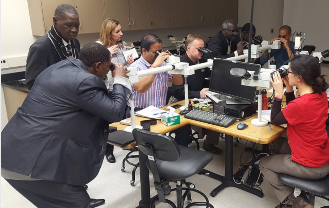
Several members of the Malian delegation examine microscope technology during a tour of MSU's Diagnostic Center for Animal Health.