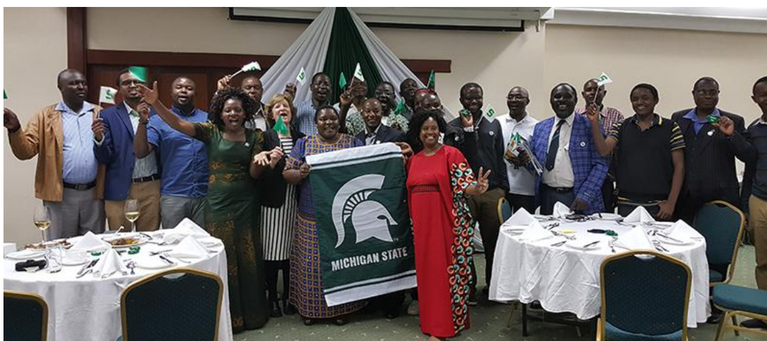
Kenyan alumni and friends of MSU at the reception.