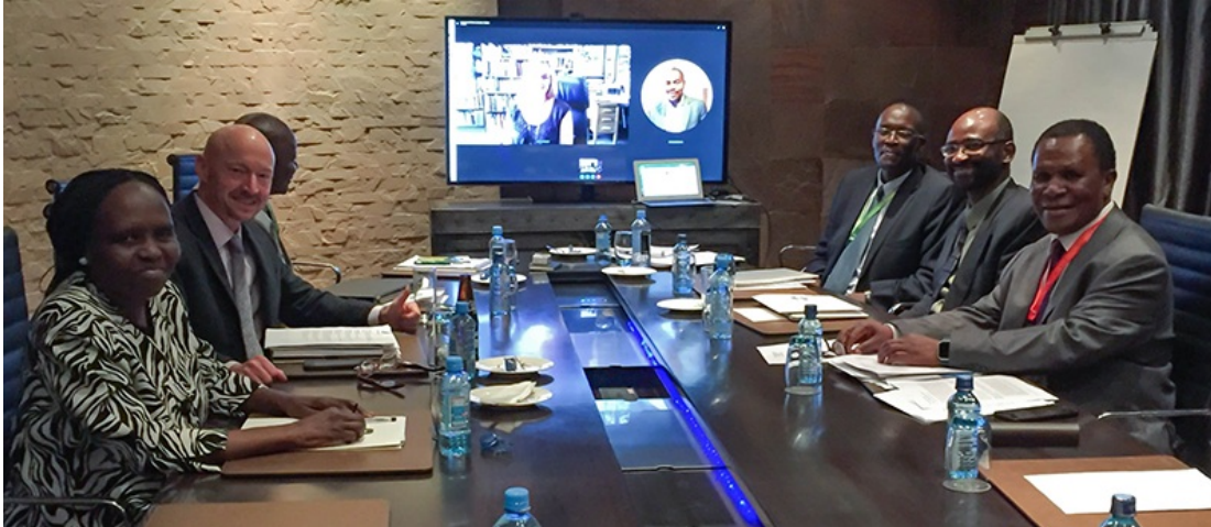
The AAP Advisory Board meets in-person and virtually to discuss and direct the future of the Alliance for African Partnership.